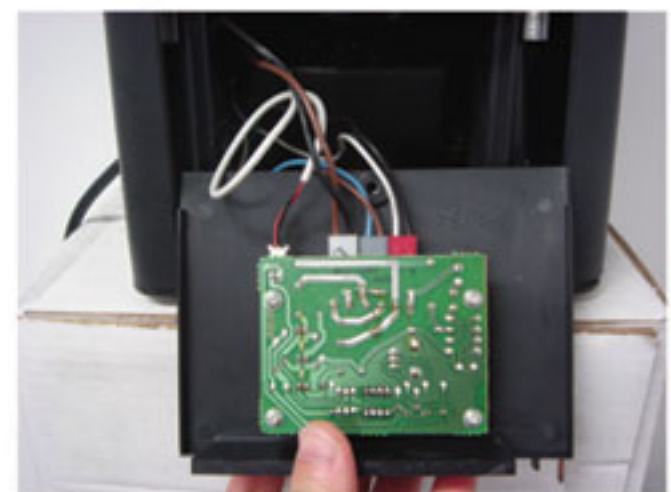
Turn Analog Controller to see the pin connectors