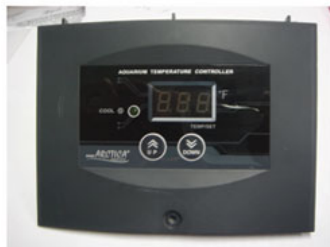
Remove old Analog Controller and swap with Digital Controller