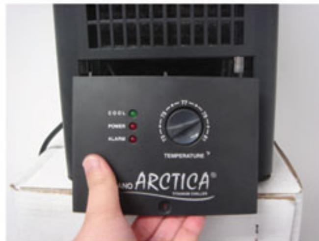
Detach Analog Controller from chiller housing