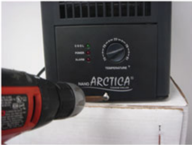
Untighten screw from bottom of Analog Controller